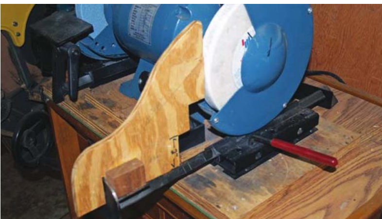
Using a simple shopmade template to set up your sharpening jig for repeatable distances saves time and tool wear.