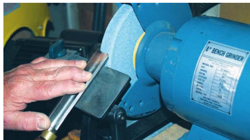
Consider learning how to hand sharpen turning tools. This allows you to place a toolrest close to the grinding wheel, eliminating many potential dangers.