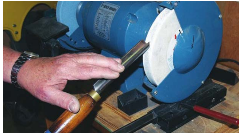
Potential danger: Using a long fixture arm and a blunt sharpening angle brings the tip of the tool too close to the wheel's equator. If the arm of the jig slips or too much pressure is exerted, it could cause the tool to jam against the wheel.