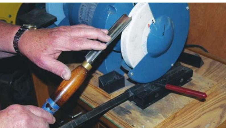
Better: Create a more acute bevel angle on your tool, which will place it higher up on the wheel in a safer position when sharpening.