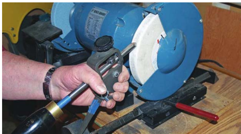
Wrong way! If the sharpening jig slips, fingers will contact the rotating wheel before the jig does.